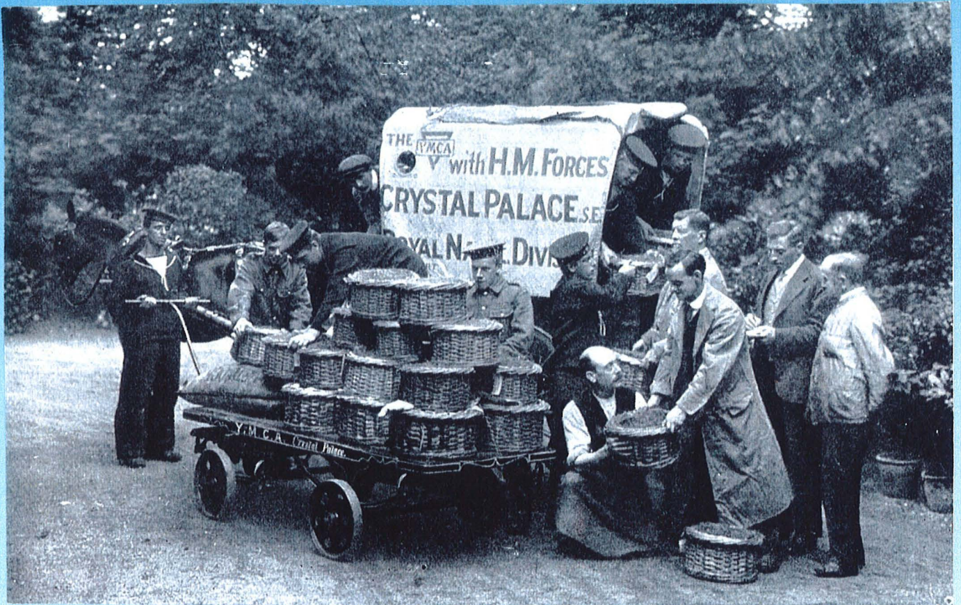
Early Morning Supplies from Covent Garden.