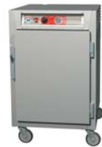
1/2 Height Solid Doors