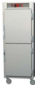
Full Height Dutch Solid Doors

Note: Add an "A" to the end of the cabinet part number when ordering accessories.