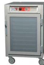
1/2 Height Clear Doors