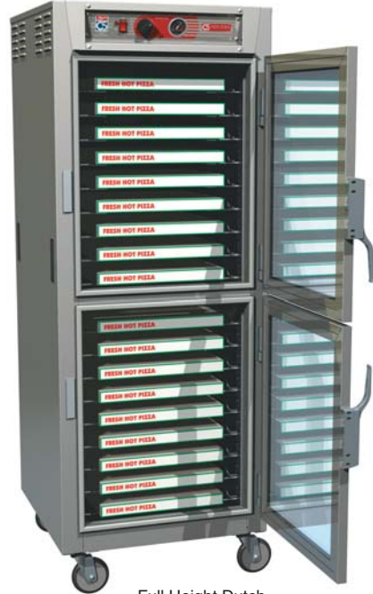
Full Height Dutch Clear Doors