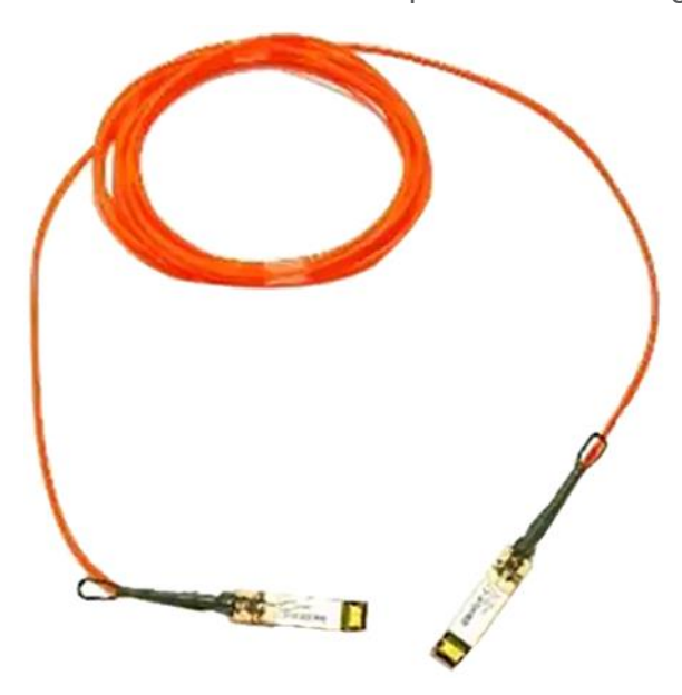
Figure 5. Cisco direct-attach active optical cables with SFP+ connectors

Cisco SFP+ Active Optical Cables (Figure 5) are direct-attach fiber assemblies with SFP+ connectors. They are suitable for very short distances and offer a cost-effective way to connect within racks and across adjacent racks. Cisco offers Active Optical Cables in lengths of 1, 2, 3, 5, 7, and 10 meters.