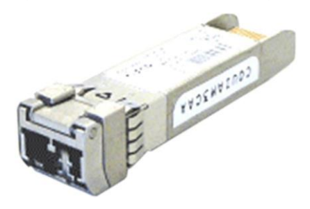
Figure 1. Cisco 10GBASE SFP+ modules

The Cisco® 10GBASE SFP+ modules (Figure 1) give you a wide variety of 10 Gigabit Ethernet connectivity options for data center, enterprise wiring closet, and service provider transport applications.