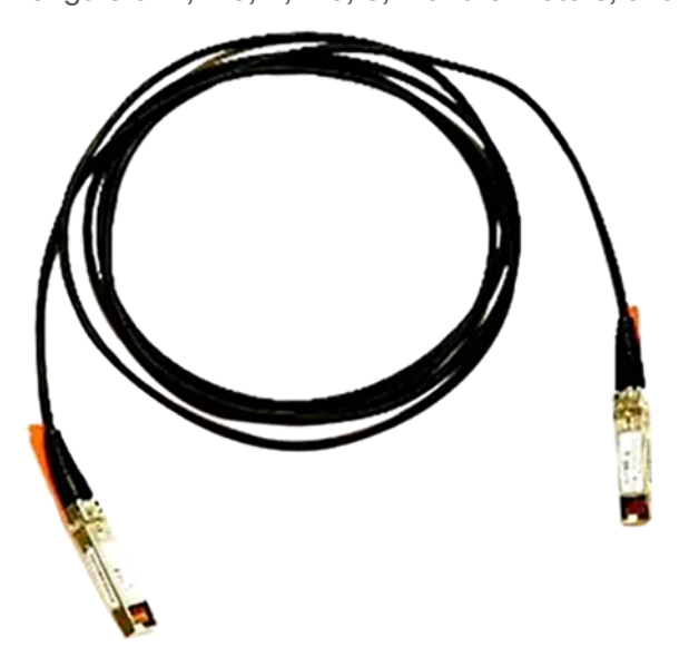
Figure 4. Cisco direct-attach twinax copper cable assembly with SFP+ connectors

Cisco SFP+ Copper Twinax (Figure 4) direct-attach cables are suitable for very short distances and offer a cost-effective way to connect within racks and across adjacent racks. Cisco offers passive Twinax cables in lengths of 1, 1.5, 2, 2.5, 3, 4 and 5 meters, and active Twinax cables in lengths of 7 and 10 meters.