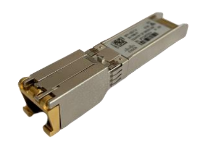
Figure 2. Cisco SFP+ 10GBASE-T module with RJ-45 connector

The Cisco 10GBASE-T module (Figure 2) offers connectivity options at the following data rates: 100M/1G/10Gbps. It has the SFP+ form factor and an RJ-45 interface so that CAT5e/CAT6A/CAT7 cables can be used to connect to end points with embedded 10GBASE-T ports. They are suitable for distances up to 30 meters and offers a cost-effective way to connect within racks and across adjacent racks.