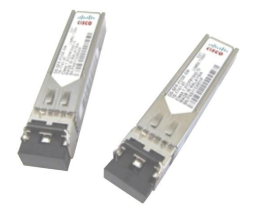
Figure 1. Cisco 2-Gbps Fibre Channel SFP Modules