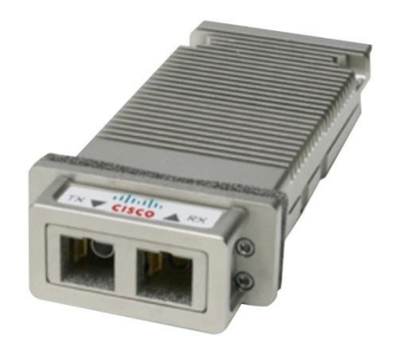
Figure 13. Cisco 10-Gbps Ethernet X2 Transceiver

The Cisco Ethernet X2 Transceiver short-reach module (up to 300m; part number DS-X2-E10G-SR) enables highperformance Fibre Channel connectivity for the MDS 9000 Family 10-Gbps Fibre Channel switching module to an existing Ethernet Dense Wavelength-Division Multiplexing (DWDM) transponder (Figure 13). The data format transmitted is identical to that transmitted by the Fibre Channel transceiver (DS-X2-FC10G-SR), except the Fibre Channel packets are clocked at the 10 Gigabit Ethernet rate to carry Fibre Channel packets over a 10-Gbps Ethernet DWDM infrastructure. The MDS 9000 Family 10-Gbps Fibre Channel switching module automatically detects DS-X2-E10G-SR; no software configuration is required.