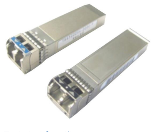
Figure 3. Cisco 8-Gbps Fibre Channel SFP+ Modules

Cisco 8-Gbps Fibre Channel SFP+ modules (Figure 3) provide Fibre Channel connectivity for the 2/4/8 Gbps ports on the MDS 9000 Family platform. Three types are available: the Cisco Fibre Channel Shortwave SFP+ (part number DS-SFP-FC8G-SW), the Cisco Fibre Channel Longwave SFP+ (part number DS-SFP-FC8G-LW), and the Cisco Fibre Channel Extended Reach SFP+ (part number DS-SFP-FC8G-ER). Each offers 2/4/8-Gbps autosensing Fibre Channel connectivity.