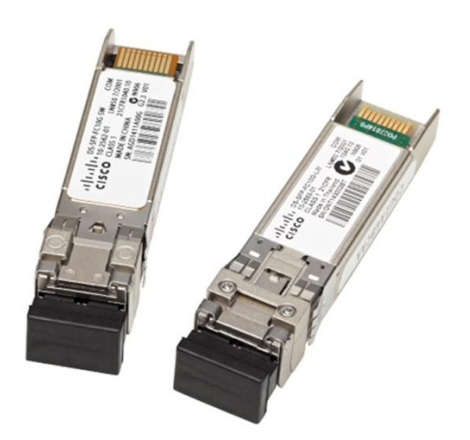
Figure 4. Cisco 10-Gbps Fibre Channel SFP+ Modules

Cisco 10-Gbps Fibre Channel SFP+ modules (Figure 4) provide Fibre Channel connectivity for the 10-Gbps Fibre Channel ports on the MDS 9000 Family platform. Two types are available: the Cisco Fibre Channel Shortwave SFP+ (part number DS-SFP-FC10G-SW) and the Cisco Fibre Channel Longwave SFP+ (part number DS-SFP-FC10G-SW).