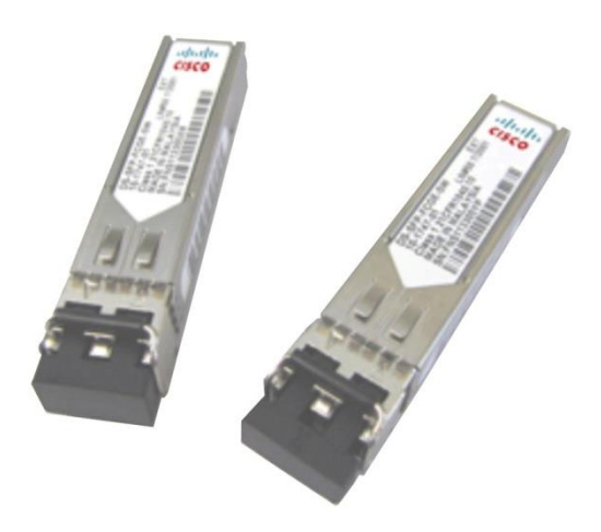
Figure 2. Cisco 4-Gbps Fibre Channel SFP Modules

Cisco 4-Gbps Fibre Channel SFP modules (Figure 2) provide cost-effective Fibre Channel connectivity for 1/2/4-Gbps ports on the MDS 9000 Family platform. Three types are available: the Cisco Fibre Channel Shortwave SFP (part number DS-SFP-FC4G-SW), the Cisco 4-km Fibre Channel Longwave SFP (part number DS-SFP-FC4G-MR), and the Cisco 10-km Fibre Channel Longwave SFP (part number DS-SFP-FC4G-LW). Each offers 1/2/4 Gbps autosensing Fibre Channel connectivity.