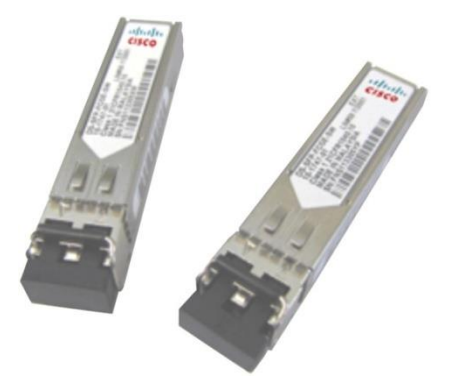
Figure 7. Cisco Tri-Rate Multiprotocol SFP Modules

Two types of Tri-Rate Multiprotocol SFP modules are available (Figure 7): the Cisco Tri-Rate Multiprotocol Shortwave SFP (part number DS-SFP-FCGE-SW) and the Cisco Tri-Rate Multiprotocol Longwave SFP (part number DS-SFP-FCGE-LW). Each offers autosensing 1/2-Gbps Fibre Channel connectivity and 1 Gigabit Ethernet connectivity.