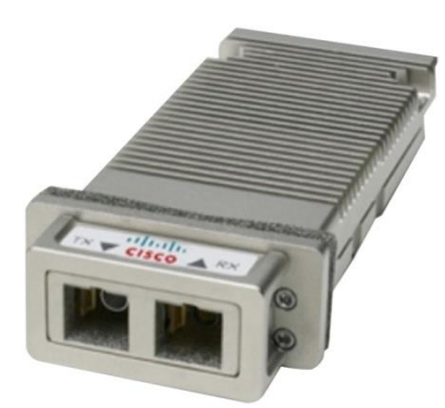
Figure 10. Cisco 10-Gbps Fibre Channel CX4 X2 Transceiver (Part Number DS-X2-FC10G-CX4)