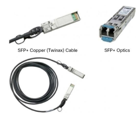
Figure 5. Cisco 10GBASE SFP+ Modules

Cisco 10-Gbps Ethernet SFP+ modules (Figure 5) provide 10-Gbps Ethernet connectivity for the Cisco MDS 9500 10-Gbps 8-Port FCoE Module and MDS 9250i Multiservice Fabric Switch.