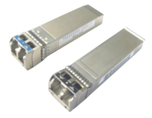
Figure 11. Cisco 16-Gbps Fibre Channel SFP+ Transceivers

The Cisco 16-Gbps Fibre Channel SFP+ Transceivers (Figure 11) provide Fibre Channel connectivity for 4/8/16-Gbps ports on the MDS 9000 Family platform. Three types are available: the Cisco Fibre Channel Shortwave SFP+ (part number DS-SFP-FC16G-SW), the Cisco Fibre Channel Longwave SFP+ (part number DS-SFP-FC16G-LW), and the Cisco Fibre Channel Extended Longwave SFP+ (part number DS-SFP-FC16GELW). Each offers 4/8/16-Gbps autosensing Fibre Channel connectivity.