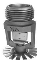
Micromatic® Model M Standard Response Standard Coverage FUSIBLE LINK

Upright Sprinklers Thread Size: 3/4 inch NPT