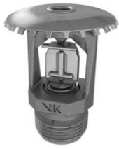
Micromatic® Model M Standard Response Standard Coverage FUSIBLE LINK Upright Sprinklers