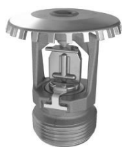
Micromatic® Model M Standard Response Standard Coverage FUSIBLE LINK

Upright Sprinklers Thread Size: 3/4 inch NPT