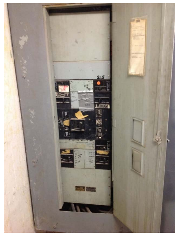
Photograph 13: SEL1-22