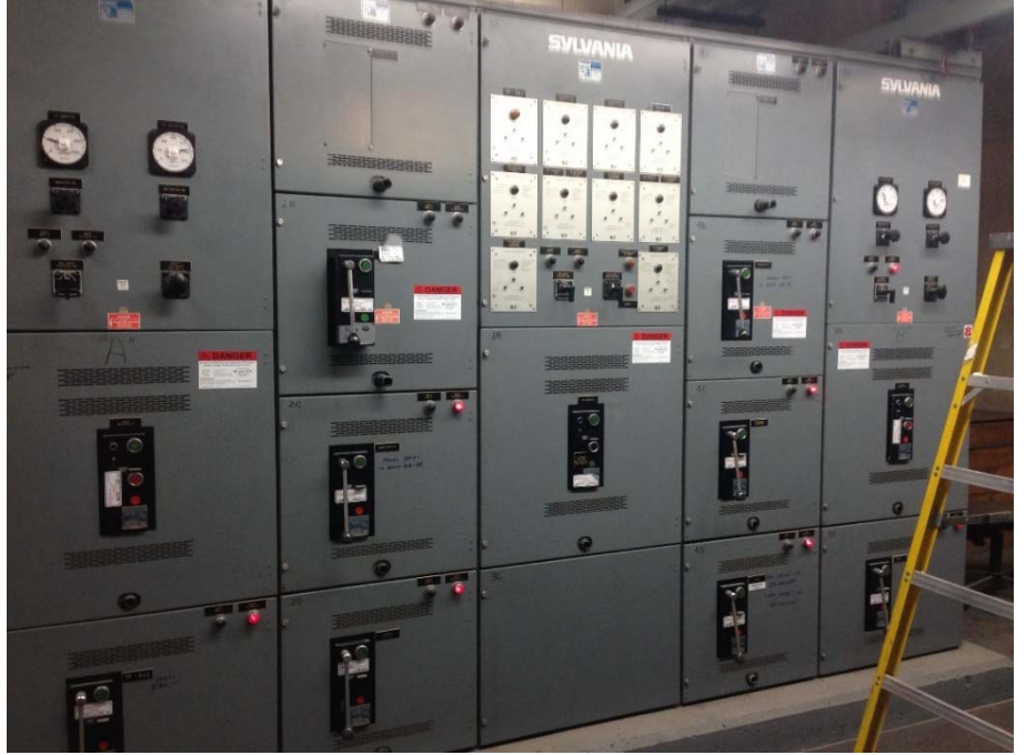
Photograph 4: USS A_B