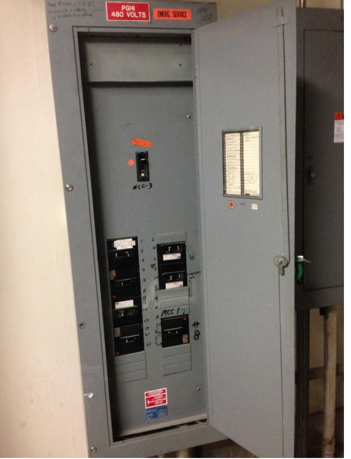
Photograph 6: PGH1