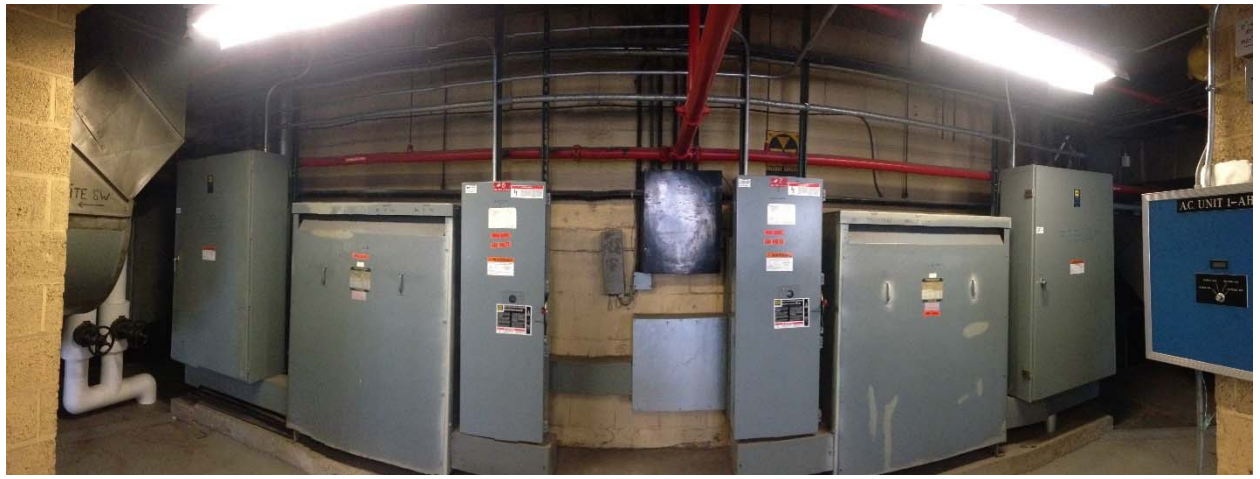
Photograph 5: ECB 13-233 & 13-238