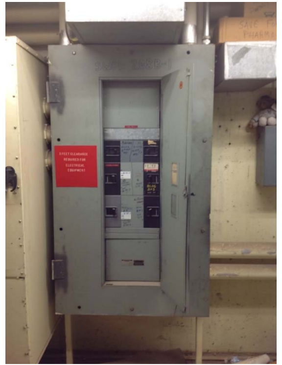
Figure 11: 208B-1