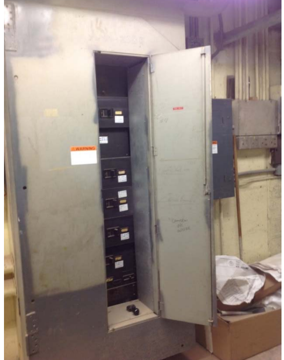
Figure 12: 208B