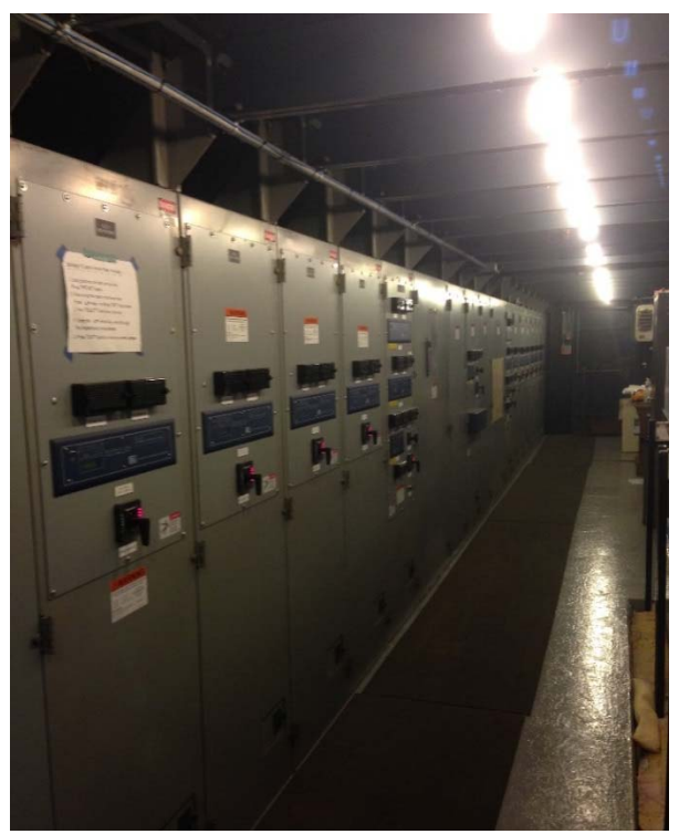
Photograph 1: Medium voltage switchgear