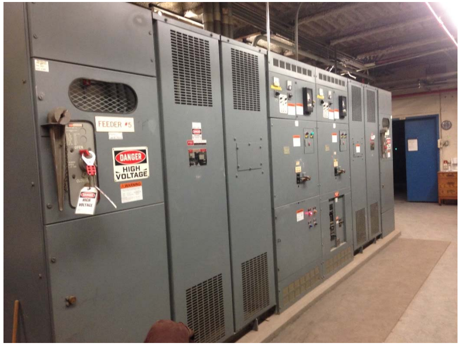
Photograph 15: USS E_F