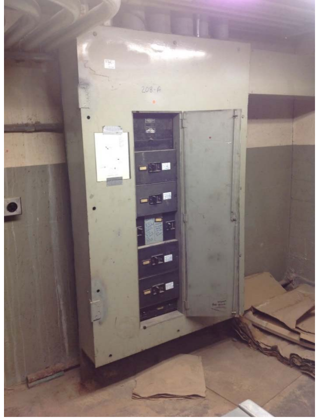
Photograph 9: 208A