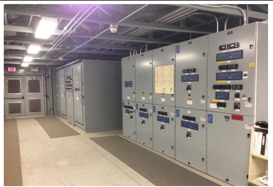
Photograph 2: Medium voltage switchgear