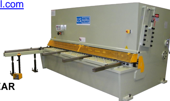
Shown with options