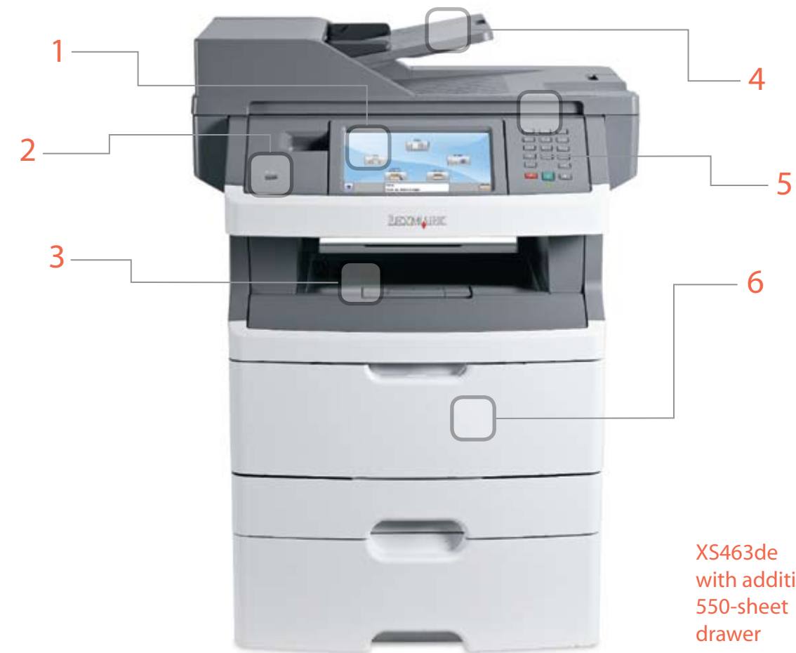
XS463de with additional 550-sheet drawer