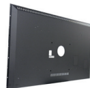
Back cover accessories