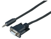
CAB-RSJA1 RS232 jack cable