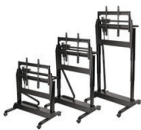
Electrical lift PT-LIFTHL-4075