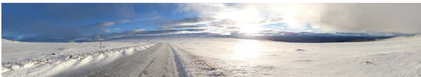
Panorama from the ‘Peace Plateau’ November 12th 2018 at 15:28 hrs.

We who have been working steadily and completely idealistically with the project for the Mt.Tron University of Peace for nearly a generation (since 1993) are looking with great amazement at how “all” now suddenly want to conquer Mt.Tron, and that every activity is in place. The engagement of the newly established association Tronfjell Oppløvelser (“Mt.Tron Excitements”), with a viewpoint at the top, is okay, but not everything is good simply because it will yield increased tourism and money. Some years back there was a lot of talk about knowledge tourism, which is good, but now the tendency seems to be towards more and more circus - entertainment, activities and experiences at any cost. Why on earth is it necessary to bicycle on narrow paths down a mountain? And why does not nature have her own value? No one is thinking for the best of nature - it is only to consume and to establish one's own rights everywhere. Rally Tron will literally overrun nature - only for the enjoyment of a very few for a very short while.