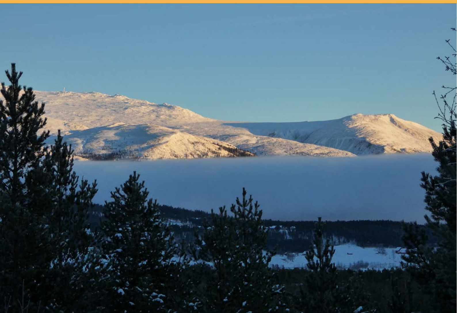
Mt. Tron seen from the entrance of Sølndalen in Alvdal, on 12.12.2018, at 11:24 hrs. The rays from the rising sun shine on the mountain snow, while the village lies under a thick cover of clouds and cold.

December 2018 * Mt. Tron University of Peace Foundation * No. 3-4 Vol. 21