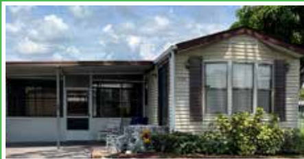
5154 Oakland Hills Ave. $115,000 480 sq. ft., 1 bed, 1 bath