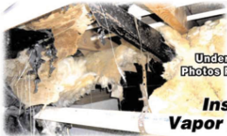
Underhome Photos Provided

Insulation Under Your Home Falling Down? Holes and Tears in Your Vapor /Moisture Barrier?