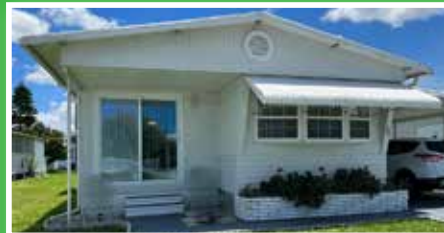
5114 Rancho Ave. $186,000 1480 sq. ft., 2 beds, 2 baths