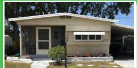
4745 Winged Foot Ave. $218,000 1248 sq. ft., 2 beds, 2 baths