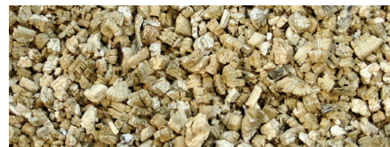
Grade 4 Vermiculite is sold in bags of 19 lb | 8.62 kg AB-VERM4