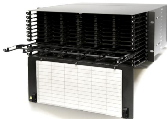
Fig. 6: 4RU Chassis (front)