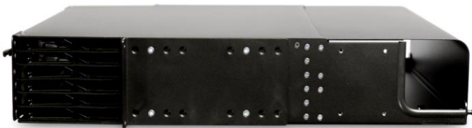
Fig. 5: 2RU Chassis (side)