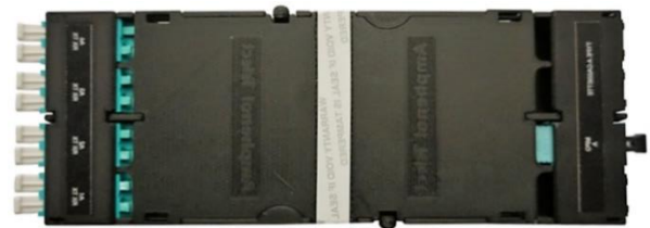
Fig. 3: HX8 Base-8 MPO Breakout