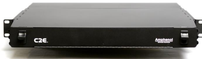
Fig. 1: C2E 1RU Chassis

The C2E chassis provides a solution that is dense, modular and tray based. It is offered as either a dedicated Base-8 solution using the C2 Base-8 modules for MPO or MTP breakout modules, or a dedicated Base-12 version.