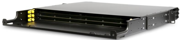
Fig. 4: 1RU Chassis (rear)