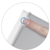
One Touch Auto-backup

TS256GSJM500 256GB TS512GSJM500 512GB TS1TSJM500 1TB