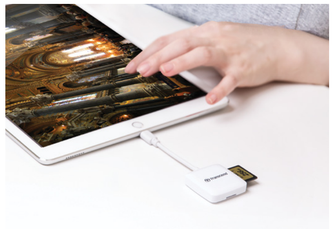
A card reader for iOS devices