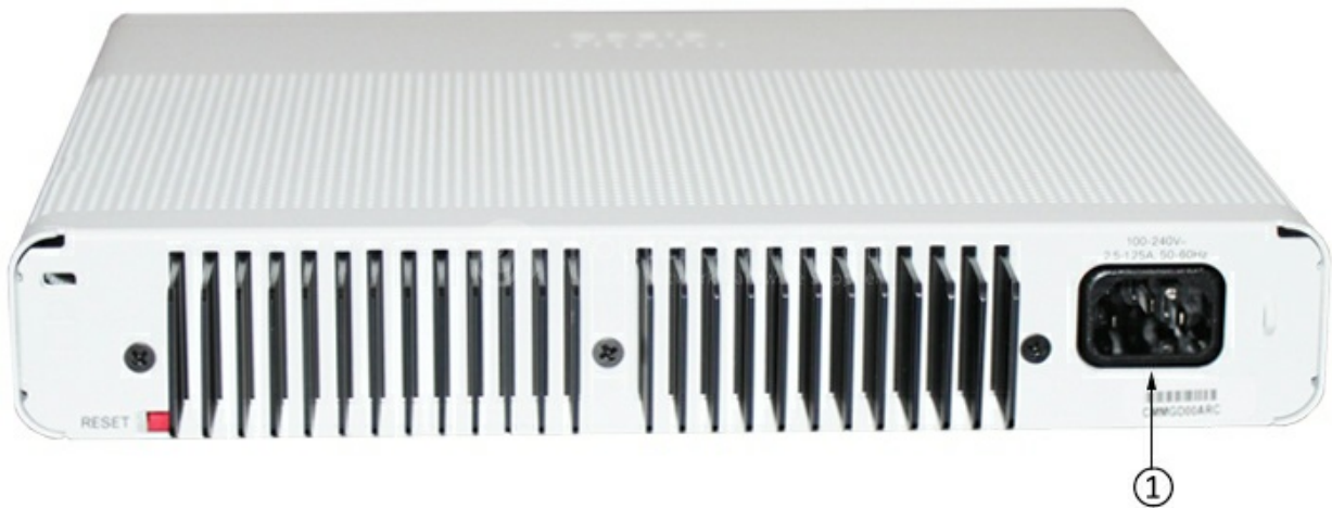
Figure 3 shows the back panel of WS-C2960C-12PC-L.