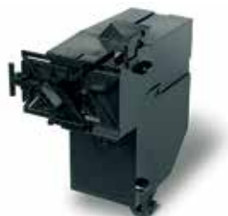
Spectrophotometer with i1 color technology from X-Rite