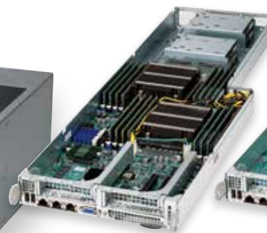
SYS-F617R2-FT+/FTPT+/F72+ 4x 2.5" HDDs per Node