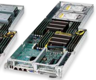
SYS-F617R3-FT+ /FTPT+ 2x 3.5" HDDs per Node