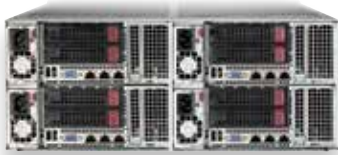
SYS-F627R2-RTB+ Rear View