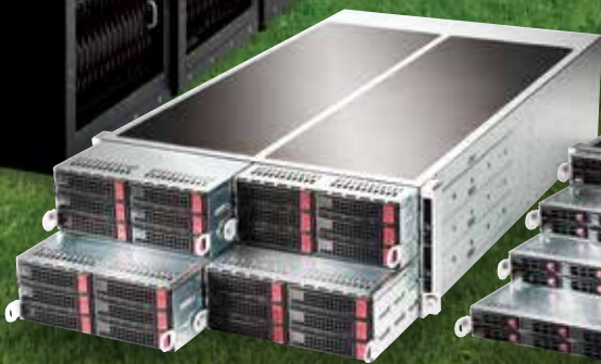
4 Nodes in 4U 8 Hot-swap 3.5" HDDs per 1U