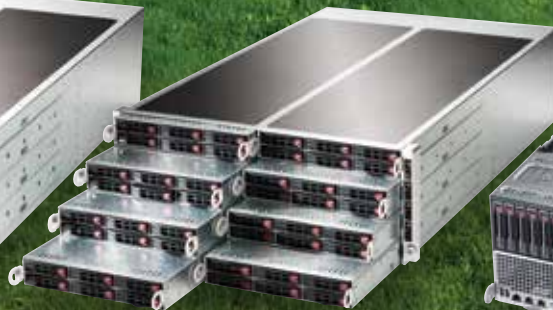
8 Nodes in 4U 6 Hot-swap 2.5" HDDs per 1/2U