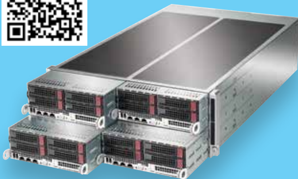
Supermicro FatTwin ™ 4-Node, Front I/O