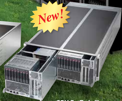
GPU FatTwin™ 6 GPU/Xeon Phi™ cards per node