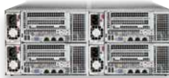
SYS-F627R2-RT+ Rear View