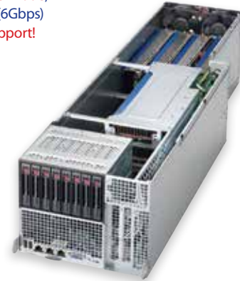
Up to 8x 2.5" HDDs per Node