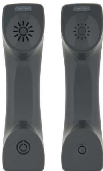
Figure 1. Cisco Unified Wideband and Narrowband Handsets

The new Cisco Unified Wideband Handset (left) looks similar to the Cisco Unified Narrowband Handset (right) (Figure 1).