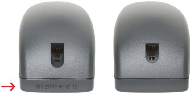
Figure 2. Cisco Unified Wideband and Narrowband Handset

The Cisco Unified Wideband Handset also has a 14-digit number printed below the handset cord connection to make it easier to identify (Figure 2).