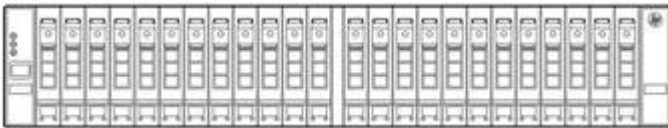
HP 3PAR StoreServ 7200 Storage

HP 3PAR StoreServ 7000 is storage made effortless.