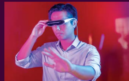
*All the images are for reference only.

Smartphones (QHD/Full HD), Tablets (WQXGA/WUXGA), Smart Watches, Notebooks, GPS, MID, VR etc.