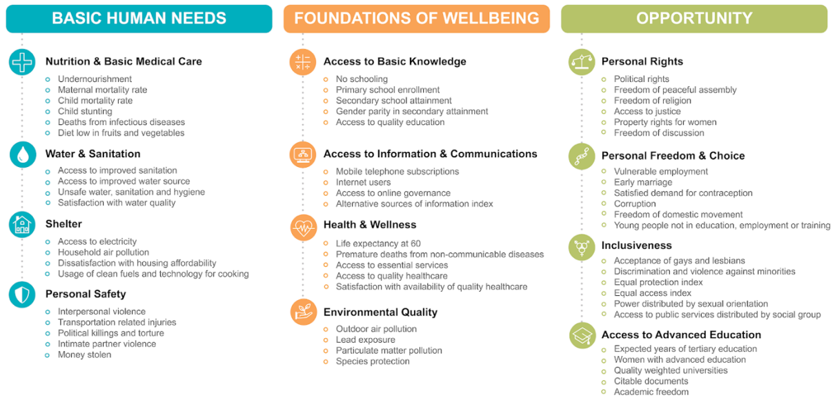
Figure 2 / Social Progress Index Indicator-Level Framework

We only include indicators that are measured well, with consistent methodology, by the same organization and across all (or essentially all) countries in our sample. We evaluate each indicator to ensure that the procedures used to produce the measure are sound and that it captures what it purports to capture. Data for each indicator must come from the same source to ensure consistency in measurement across countries.