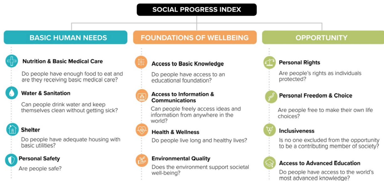
Figure 1 / Social Progress Index® Component-Level Framework

Together, these interrelated elements combine to produce a given level of social progress. The Social Progress Index methodology allows measurement of each component and each dimension, yielding an overall score and ranking.