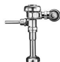
REGAL 180 XL

**Contact Your Local Sloan Representative