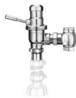
DOLPHIN TYPE 1 CLASS A

**Contact Your Local Sloan Representative