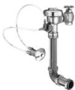
REGAL 9603 XL