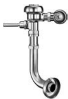
REGAL 120 XL