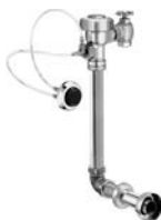
REGAL 940-1.6 XL