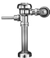
REGAL 110 XL