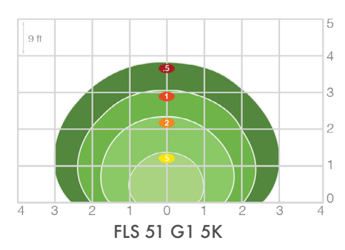
At 15 ft setback and aimed 30 degree upon horizon