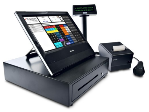
P.O.S. Point of sales

Digital Signage Visual advertising, entertainment, displaying information in public areas