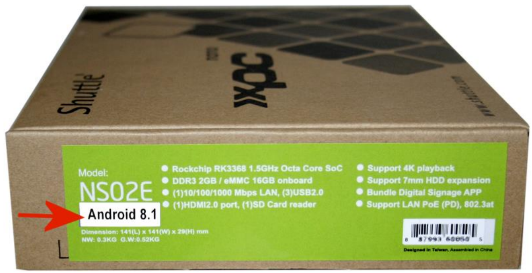
New Android version is mentioned on the label of the package.

The NS02A/E Android 5.1 version cannot be updated to Android 8.1 by customer. This is a chargeable Shuttle service (support@shuttle.eu).