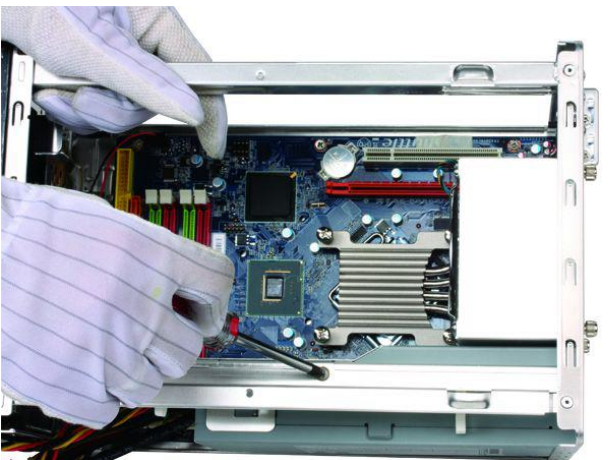
In Finally, secure again from top with Phillips head screw.