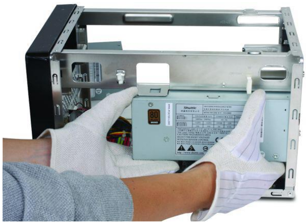
• Place the power supply in position. Secure from the back with three Phillips head screws.