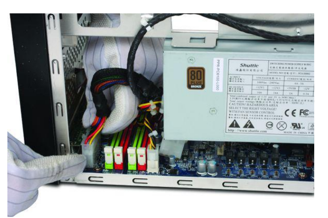
③ Attach the 20-pin ATX and 2x2-pin (or 1x4-pin) power supply plugs to the mainboard.

② Feed the HDD cable through the reverse hole as shown and attach to storage devices.