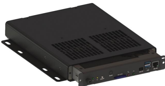
Picture 6 STv2 Standalone Adapter ( NEC Order Code 100013143 )

Other languages of this document, drivers and information, can be found at: Andere Sprachen dieses Dokumentes, Treiber und weitere Informationen finden Sie unter: Autres langues de ce document, les pilotes et autres informations, s'il vous plaît visitez: Altre lingue di questo documento, driver e altre informazioni, si prega di visitare il sito: