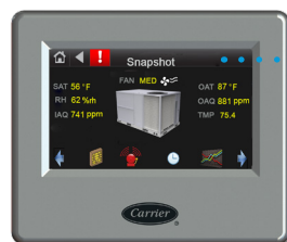
Equipment Snapshot Screen