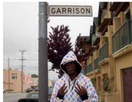
Photo 194: Gaspie throwing the "3" underneath the Garrison Street sign