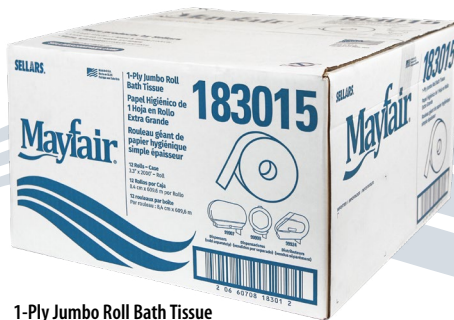
1-Ply Jumbo Roll Bath Tissue (2000') Outer Case