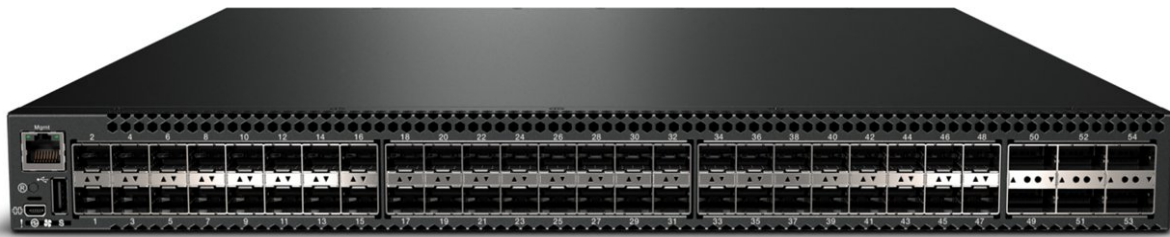
Figure 1. Lenovo RackSwitch G8272

The RackSwitch G8272 is shown in the following figure.