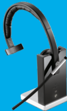
MONO (IN DOCK)