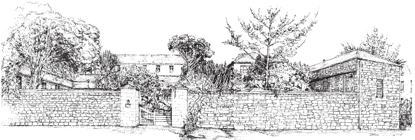
Fig. 2. The setting of the Botany Department in the 1980s, from a drawing by Michael Ginn.

of the entire plant kingdom was the major focus of botany. For many botanists of the day, knowledge of the plant kingdom from the minutest algae to the higher plants was their identifying mark. It is not surprising that Schonland, as a systematist, had many new species of plants named after him, such as Rhus schonlandii and Aloe schonlandii . He collected, described and re-classified many of the difficult groups in the region, such as the sedges, the Cyperaceae in 1922, 6 and the woody trees and shrubs of the genus Rhus in 1930. 7