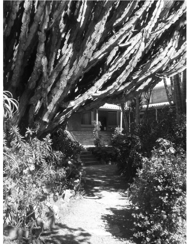
Fig. 1. A view of the Botany Department's garden in 2004.

Just as the garden has changed and matured over the years, in this account we will see how the Botany Department has evolved. Several sub-disciplines of botany have evolved and flourished and sometimes deviated from the core subject, while others have grown in diversity and stature.