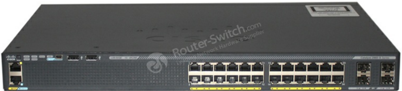
Table 1 shows the Quick Spec of the Cisco 2960X-24TS-L switch.

Figure 1 shows the front view of the Cisco 2960X-24TS-L switch.