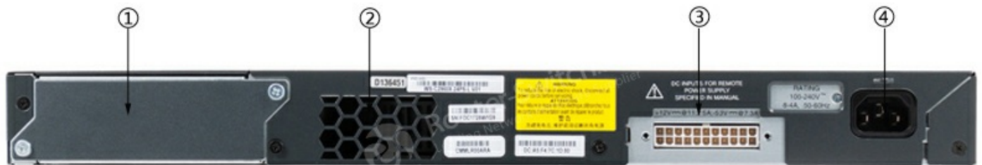
Figure 3 shows the back panel of the Cisco 2960X-24TS-L switch.

The Switch LEDs include SYST, STAT, SPEED, RPS, MAST, and STACK LEDs.