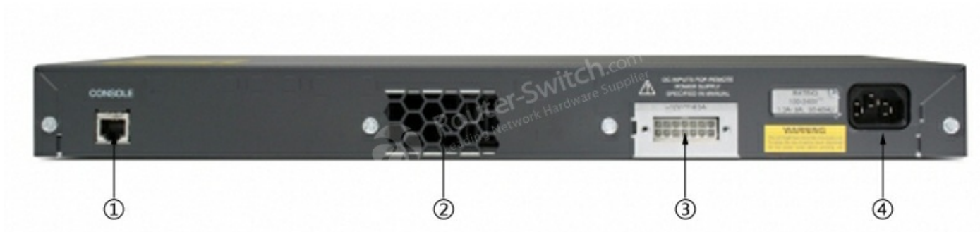
Figure 3 shows the back panel of WS-C2960+48PST-L.

·Each of the PoE ports deliver up to 15.4 W of PoE.