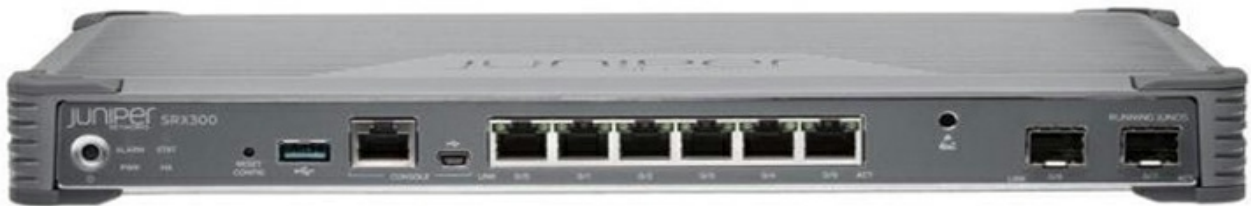
Table 1 shows the quick spec.

Figure 1 shows the appearance of SRX300-SYS-JB.