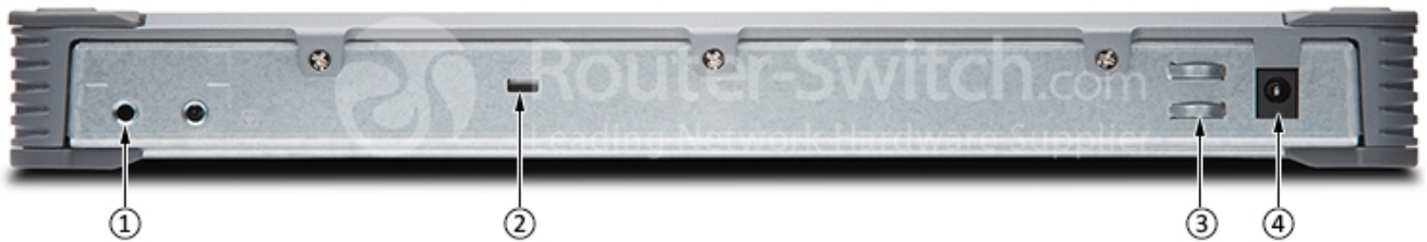
Figure 2 shows the rear panel of SRX300 Chassis.