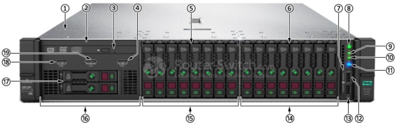
Figure 1 shows the Front View – SFF chassis with optional Universal Media bay with optical and 2 NVME plus 16 NVMe shown.