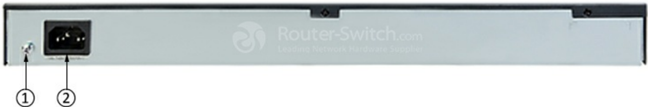
Figure 3 shows the back panel of HPE JH018A.