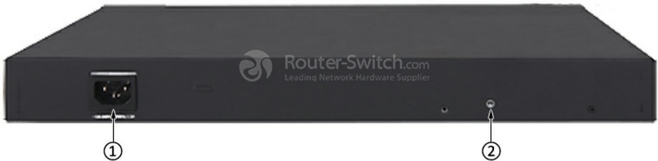
Figure 3 shows the back panel of HPE JG961A.