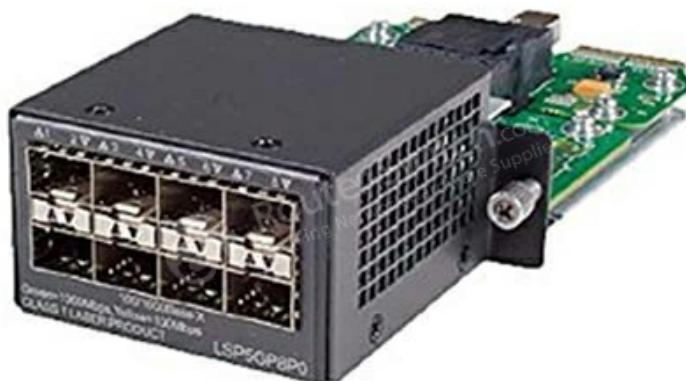
Table 1 shows the quick spec.

The figure shows the appearance of HPEJG313A.