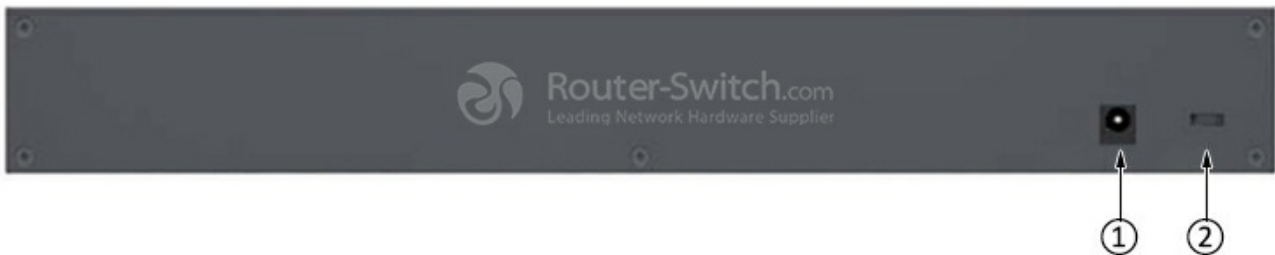
Figure 3 shows the back panel of HPE J9663A.