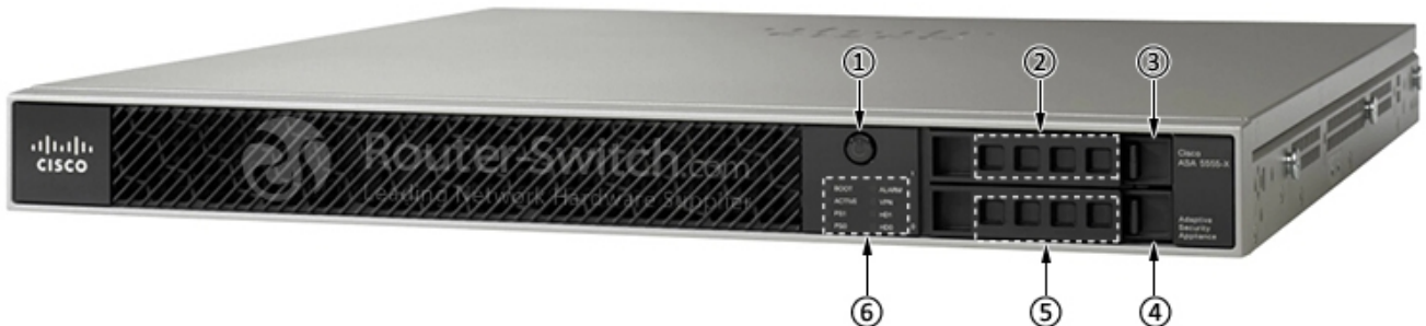
Figure 1 shows the front panel.