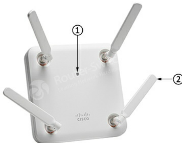
Figure 1 shows the AIR-AP1852E LED Indicator Position.