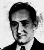
By Leonard Lyons

NEW YORK: Paul O'Dwyer addressed a group of lawyers at a fund-raising dinner at the St. Moritz Hotel, and received a glowing introduction. It reminded him of a businessman who had received countless testimonials and honors for his service to the community and aiding charities. On the way home, the businessman leaned back in the car and said to his wife: "Tell me, dear, how many truly great men are there in the world?"