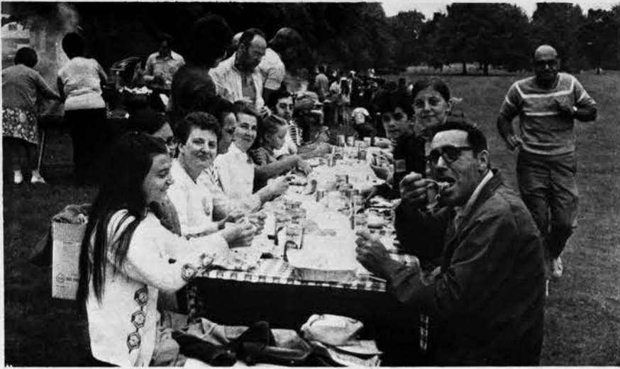
CLOUDY SKIES did not dampen the spirit of the annual Miriam Hospital Picnic held at Goddard Memorial Park in Warwick on June 17. Departments heads, members of administration and volunteers barbecued hamburgers and franfurts for the crowd of 350 employees and friends of the hospital. There were games for the children, softball and music provided live by Strength, Inc.