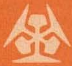
TABLE OF FARES