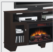
Engineered Oak Espresso (PE91)