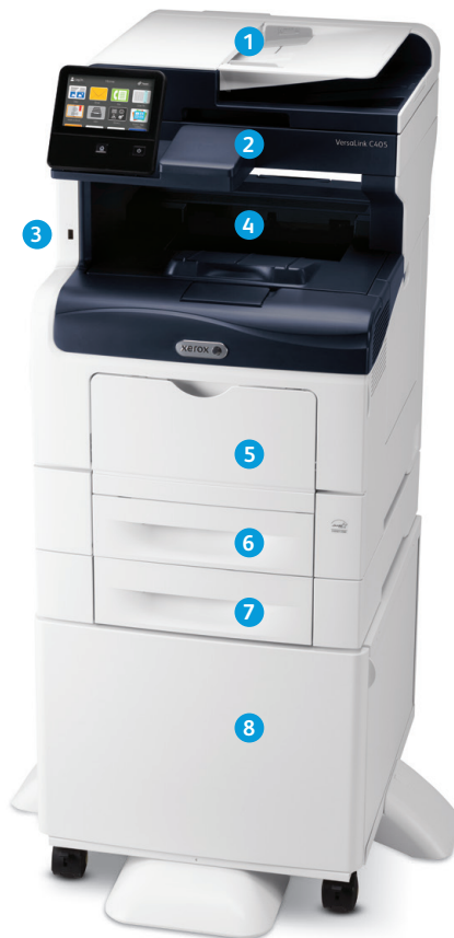
Xerox® VersaLink® C405 Color Multifunction Printer Print. Copy. Scan. Fax. Email.