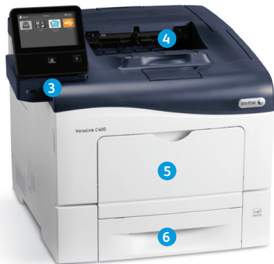
Xerox® VersaLink® C400 Color Printer Print.