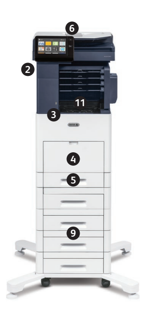
Xerox<sup>®</sup> VersaLink<sup>®</sup> B600 Printer Print.