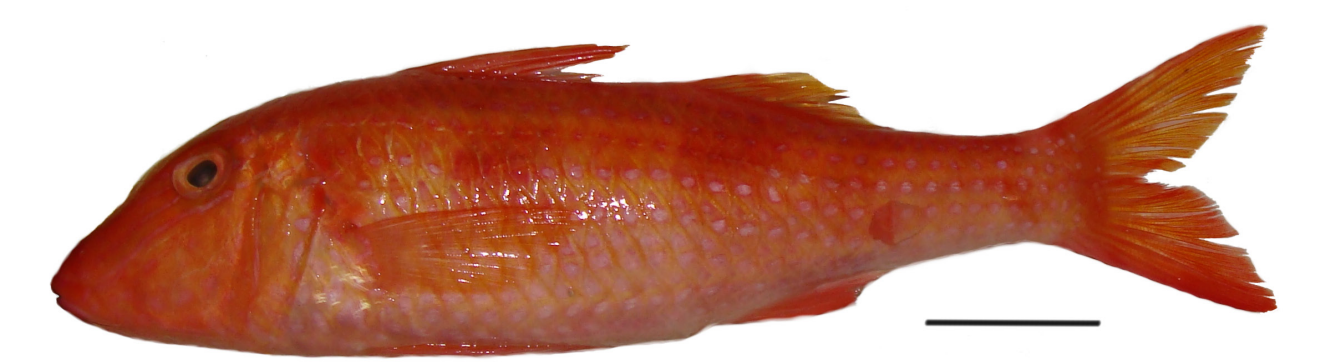
Figure 1 - The host Pseudupeneus maculatus, from the Coast of Pernambuco State, Northeast Brazil. Scale bar: 3 cm.

Regarding the levels of infestation, the present study found similar prevalence and intensities to those reported previously. The prevalence of the parasite found in this study was slightly higher than that reported by Luque et al. (2002), Cavalcanti et al. (2013), Hermida et al. (2014) and Carvalho-Souza et al. (2009) (Table I).