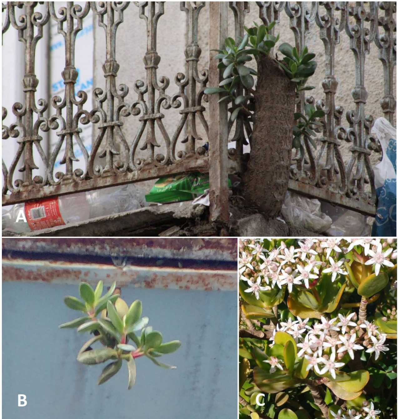
Figure 3. Crassula ovata in urban habitat at Skikda city (northeastern Algeria): on balcony, 19 May 2022 (A), on metal roof, 01 June 2022 (B), flowers of individual on balcony, 21 January 2023 (C).

19.05.2022 and 15.02.2023. On 25.04.2022, another individual was found at Bachir Boukadoum Avenue growing in the gutter of an old house (Table 1, individual no 4).