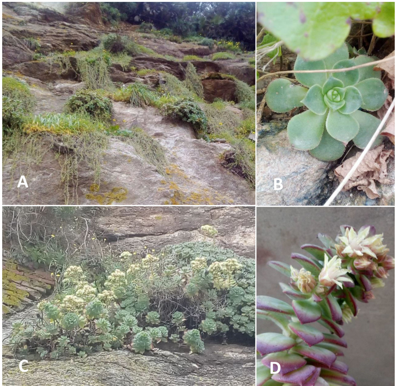
Figure 2. Population of Aeonium haworthii on a coastal cliff at Stora (Skikda, northeastern Algeria): individuals without flowers, 21 January 2021 (A), rosette of fleshy leaves, 21 January 2021 (B), individuals with flowers, 06 May 2021 (C), details of flowers, 06 May 2021 (D).

the port of Stora (Municipality of Skikda); there, dozens of individuals of different sizes were first observed on 09.02.2021 (15 tufts were identified with sizes varying from 25 cm to more than 1 m in diameter), then re-observed on 15.05.2022 and 05.03.2023 (Table 1, Population no. 1); during